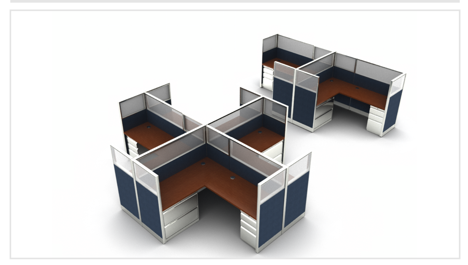
Total List Price $39,495.00

IMPORTANT: This is not a quotation; All prices are approximate and are for budgetary purposes only. A quotation will be presented separately upon request and will be subject to our normal terms and conditions.